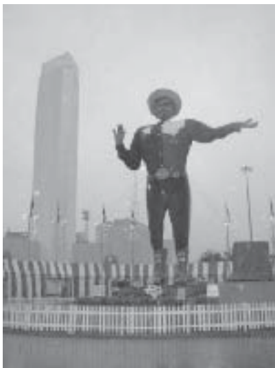
Big Tex and the Tower building

We will enjoy quality training during the day and take a trip to the TEXAS STATE FAIR in the evening!